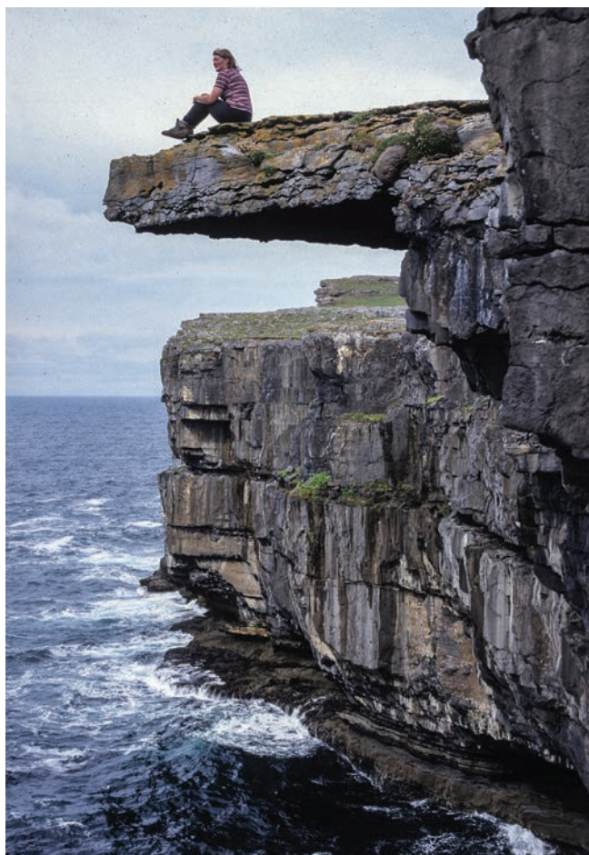
Viewpoint on the cliffs near Dun Aengus, after stability of the limestone slab had been carefully assessed and the photographer had got onto another precarious ledge.

within the right-angle systems that are conspicuous across the whole island. Despite appearances, it is a natural feature (though claims of recognising a few cut marks suggest that its shape could possibly have been tidied up by a little trimming of stray blocks). It is not related to the mythical sea monster that provided its fanciful name. The pool is 15 metres deep, and divers have passed through the wide underwater cave that is only 25 metres long to the open sea. Storm waves can break over the rock platform, but low tide and low surf reveal a most unusual site, which is now the venue for an annual cliff-diving competition.