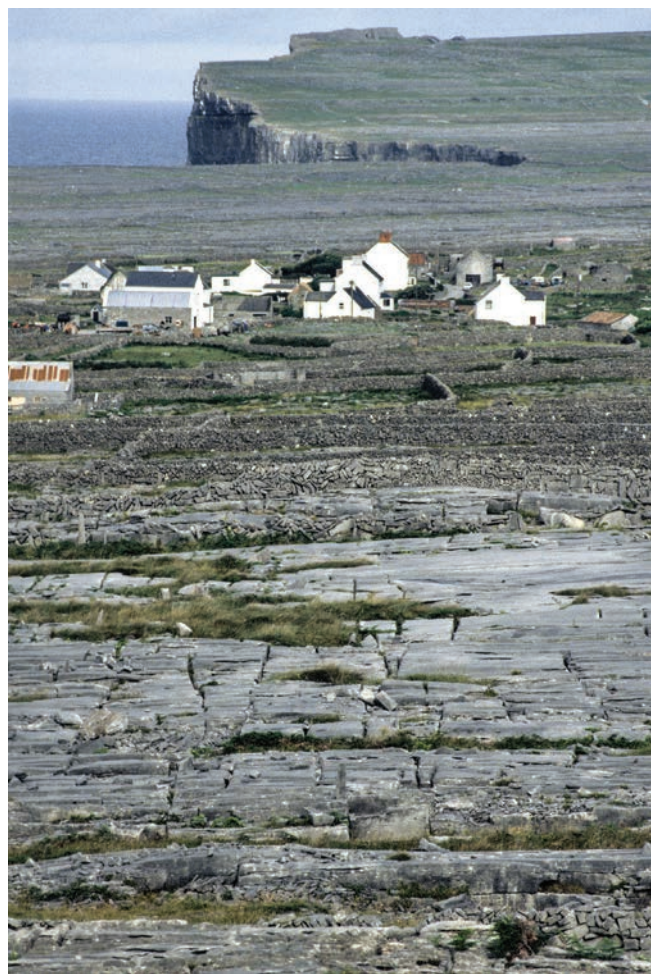
Looking westwards across the main limestone pavements of Inishmore, dipping at about one degree to the left (south) with fort of Dun Aengus on the skyline far beyond the cottages of Gort na gCapall.

Largest and outermost of the three islands is Inishmore (Inis Mór in Irish, which translates as Great Island ), 14 km long and around 2 km wide, with Kilronan as its main village and little more than isolated cottages elsewhere. Much of the island is bare limestone pavement, on a truly spectacular scale. Soil is sparse, and mostly lies along the northern fringe, away from the Atlantic weather and sheltered beneath low north-facing scarps. The Aran limestone sequence is notable for its relatively thick shale horizons between some of the limestone beds, and these would have provided elements of mineral soil on the stepped terrain. Probably most of the island's fields were improved by