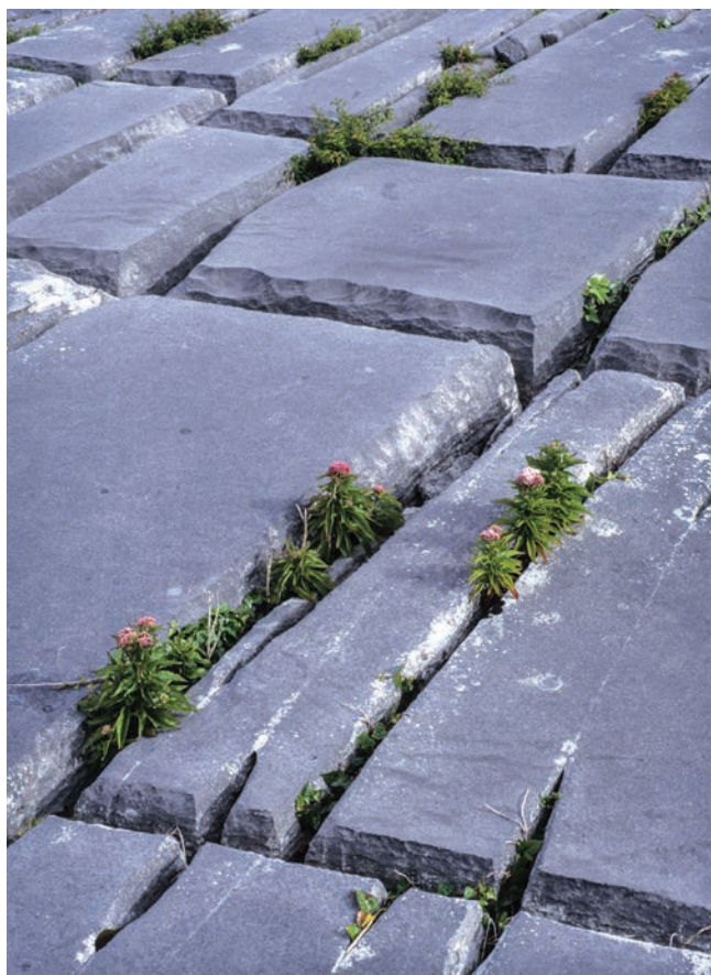
Distinctive clint morphology with flat tops and sharp edges to the grikes.

These Aran pavements differ from those in classic sites on the same limestone in and around the Yorkshire Dales, because the Aran clint blocks are not rounded over the edges that drop into the grike fissures. Rounding of features in limestone pavements is normally due to sub-soil formation, where soil can hold corrosive water against the limestone and permit dissolution from all angles. Where drainage runnels have been formed,