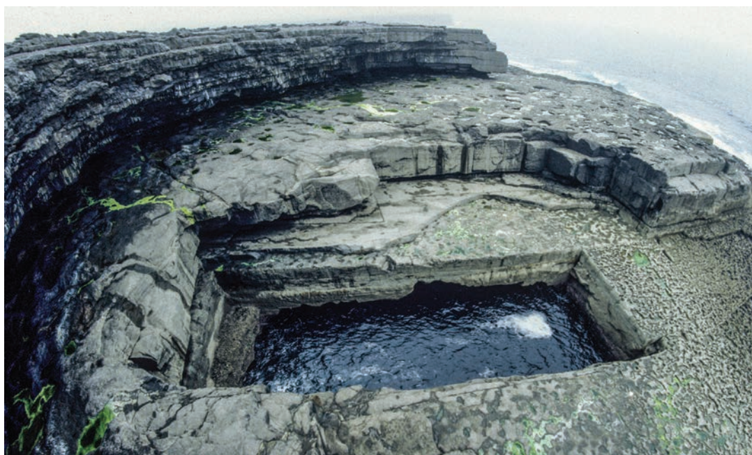
The joint-guided pool of the Wormhole broken into a wide limestone ledge close to sea level.

From Dun Aengus, the cliff scenery towards the east fully justifies a walk that is in the right direction back to Kilronan and also passes the Wormhole. Cut into a lower rock bench, this is a singularly clean-cut, rectangular pool, some 30 m by 12 m in size. It was formed by block collapse into an underlying sea-cave, where the breakdown was guided by well-defined joints